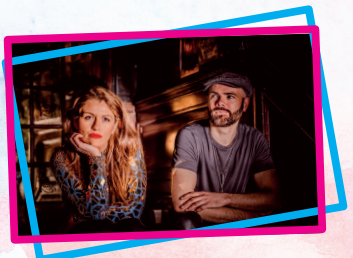
Sapphire Notion are a Blues, Rock and Jazz infused music duo. With looped guitar, piano and voice, they are regular performers throughout Scotland.

Wicked Pitch are a small but mighty group of singers who bring their full-bodied sounds to popular music and are quickly gaining a reputation for being the 'choir with the mash ups'. Good tunes. Good Times.